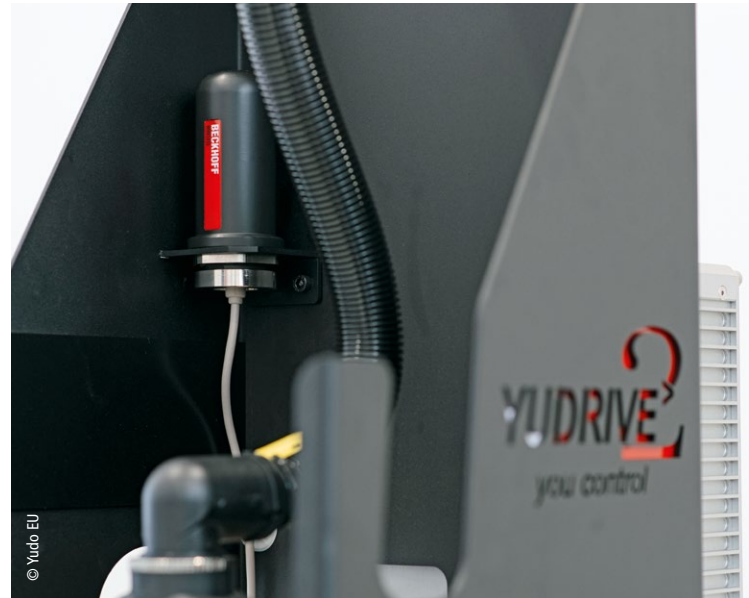
A WLAN USB stick mounted in the CU8210-M001 IP66-rated cabinet dome facilitates remote access the system on site.

A common control platform further simplifies operation and maintenance as only one type of system needs to be maintained. Operators are supported by comprehensive diagnostic information. Diagnostic data is displayed via a responsive HTML5-based HMI developed by Yudo, which communicates with TwinCAT 3 via ADS. A remote access point is set up via a CU8210-D001 WLAN USB stick mounted outside the housing and protected by a CU8210-M001 IP66-rated cabinet dome from Beckhoff. This allows easy connection of mobile devices such as tablets on which the HMI is displayed in a browser. This provides the operator with a wide range of functions, such as manual loading of a recipe, testing the opening and closing of valves gates, and monitoring